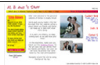
Have a look at our new web site: www.AlandAng.com .