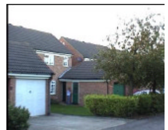
This is the house that we're living in, in Cambridge.

Most of you should know I'm doing statistics for medical research. Although I wasn't enjoying it at first – its getting much better as I get involved in more varied projects. Cycling to work is fun (only 10 mins!!) – and I'm slowly getting to know people at work. My PhD viva is on the 10 th Jan (an oral examination with two examiners) – that's when I find out if I will be awarded my doctorate (prayers are much appreciated)!